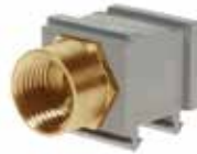
M16 x 1,5