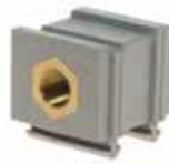
M8 x 0,5