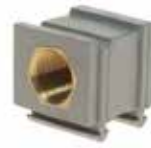
M12 x 1