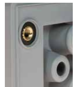
M4 threaded inserts